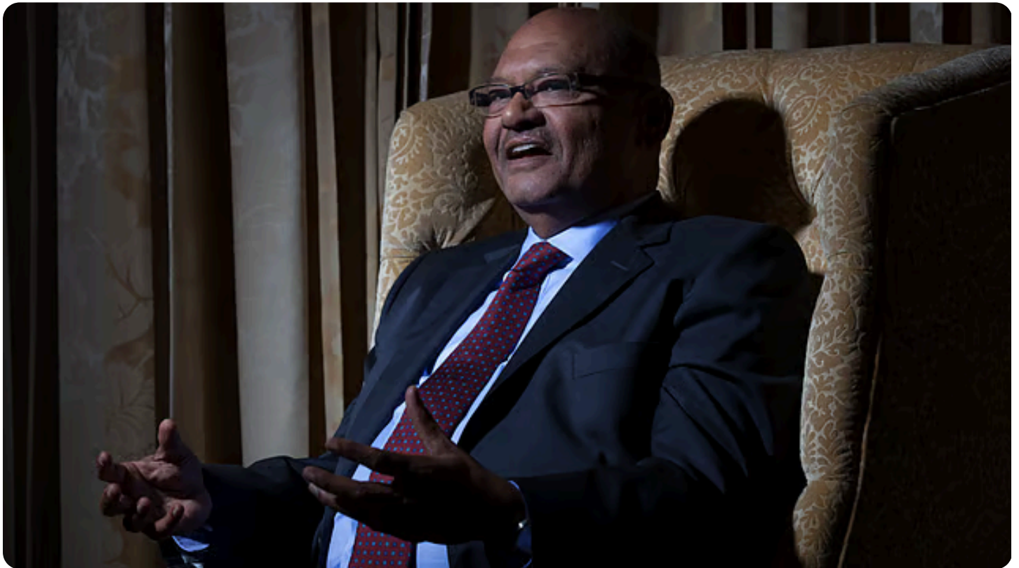
Anil Agarwal, Chairman of Vedanta Group.