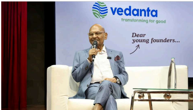
Vedanta chairman Anil Agarwal

Vedanta chairman Anil Agarwal on Tuesday shared a message for young startup founders, urging them not to lose sight of their original purpose while chasing funding, valuations and growth milestones.