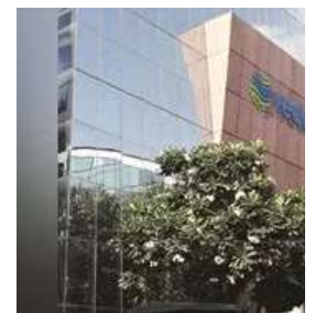
Vedanta forays into real estate