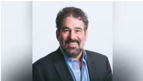
Pegasystems opens new Bengaluru office with ₹60-crore investment