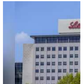
Eli Lilly launches India's solid tumours

Topics : Vedanta Hindustan Zinc Mining industry