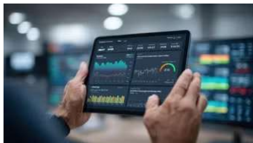
Stocks to Watch today: Airtel. Adani Power. Vedanta.