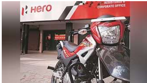
Hero MotoCorp, WeWork lease 3.5 lakh sq ft in Worldmark for ₹922 crore