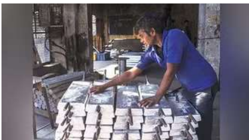
Vedanta. NALCO. Hind Zinc: Metals stocks dip up to