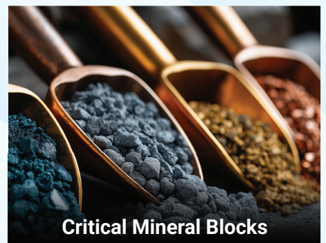
Critical Mineral Blocks

Ferrochrome and stainless-steel exposure