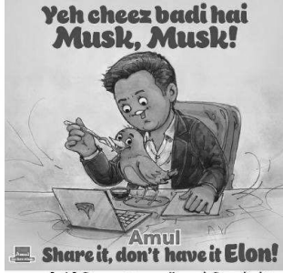
अब्जाधीशांनी ट्विटर ला 44 अब्ज डॉलर मध्ये विकत घेतले!

त्यासह, १५ पॅलिस्त्रीनो पथक तेजात करण्यात आले होते. दोन जेसीबी, दोन डमरसह अन्य यंत्रणेचा वापर करण्यात आला. ही संयुक्त कारवाई सकाळी ११.३० वाजता सुरू झाली आणि सायंकाळी ४ वाजेपर्यंत पूर्ण करण्यात आली.