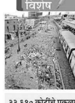
३३,६९० कोटीचे प्रकल्प पूर्ण करण्याचे नियोजन मार्च २०२१मध्ये एमपीटी ३ अ या प्रकल्पसंचालना मंडळी मिळाली आहे. या प्रकल्पसंचालना मंडळाने ३३,६९० कोटीचे रेल्वे प्रकल्प पूर्ण करण्याचे एमआरटीसीचे नियोजन आहे.

मुंबई : राज्य विरुद्ध केंद्र अशी छडाडणी शेतार सुरू असतानाच रेल्वे मंडळाने सापडी आणि आरक्षण हाताने दिशेने पाहले टाकण्यास सुरुवात केली आहे. त्याचा थेट परिणाम मुंबई नगरी परिवहन प्रकल्पातील (एमपीटी) 'सीबीटीसी' अर्थात 'कम्युनिकेशन वेड इन्फ्रस्ट्रक्चर' या आधुनिक सिग्नल प्रकल्पावर होतार आहे. रेल्वे मंडळाने सुरुवात केली आहे. रेल्वे मंडळाने सुरुवात केली आहे. रेल्वे मंडळाने सुरुवात केली आहे.