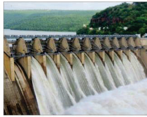
WATER LEVELS AT RESERVOIRS

Water levels in India's 150 key reservoirs have fallen sharply to 18% below last year's level, on Thursday, due to a deficient monsoon last season and scanty rainfall in winter months, reports Sandip Das. Water levels were 5% below the last 10-year average. As many as 42 reservoirs in southern states currently fill up to only 36% of total capacity as per Central Water Commission data. In the east, 23 reservoirs hold more water than last year and also the 10-year average. Although lower water level is unlikely to hit the rabi sowing, prolonged dry climate during the winter months could lead to development of pests in several crops.